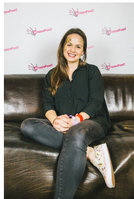
Above from left to right: CoppaFeel! Ambassadors Perrie Edwards, Greg James, Carrie Fletcher and Giovanna Fletcher.