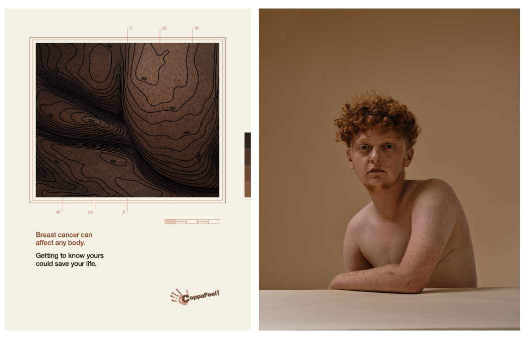
Above left: Outdoor and press advertising creative from CoppaFeell's Know Yourself , Right: Image by Kristina Varaksina from the exhibition to be held in October at Fujifilm's House of Photography

Alongside the TV ad, CoppaFeel! will be launching a radio campaign and out-of-home adverts. For the latter, they have collaborated with Fujifilm and photographer Kristina Varaksina on a series of sculptural 'body landscapes', portraits which have been mapped with bespoke topography lines and will be shared on billboards, press and social media throughout September and October. The images are a celebration of bodies in all their glory - exploring the folds, juts, dimples, crinkles and curves that form each person's unique landscape, and will be exhibited in Fujifilm's House of Photography gallery throughout October - Breast Cancer Awareness Month.